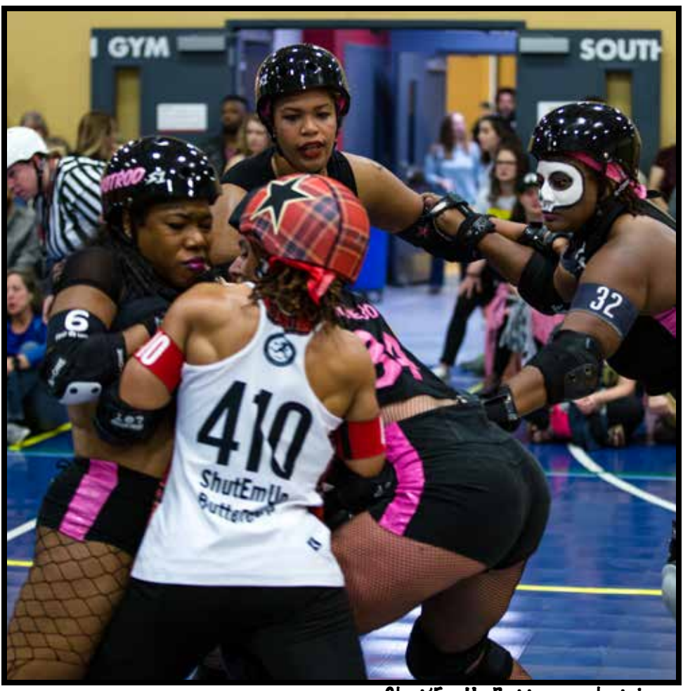
Shut'Em Up Buttercup shut down