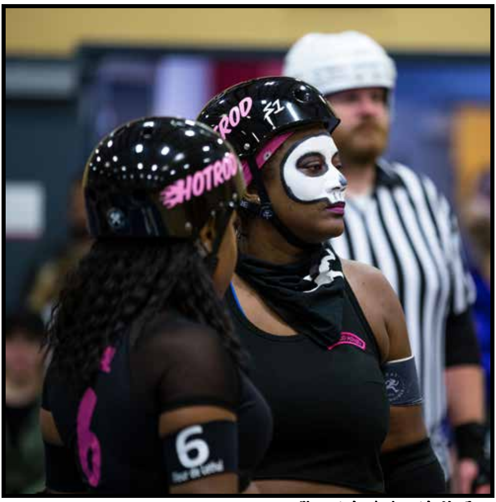
Fleur de Lethal and LaVooPoo