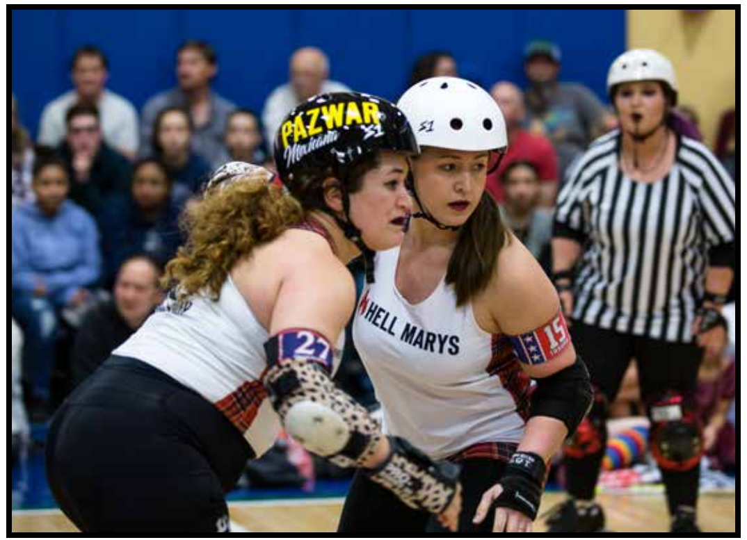
PeaceWar and Trauma