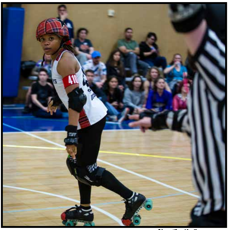
Shut'Em Up Buttercup