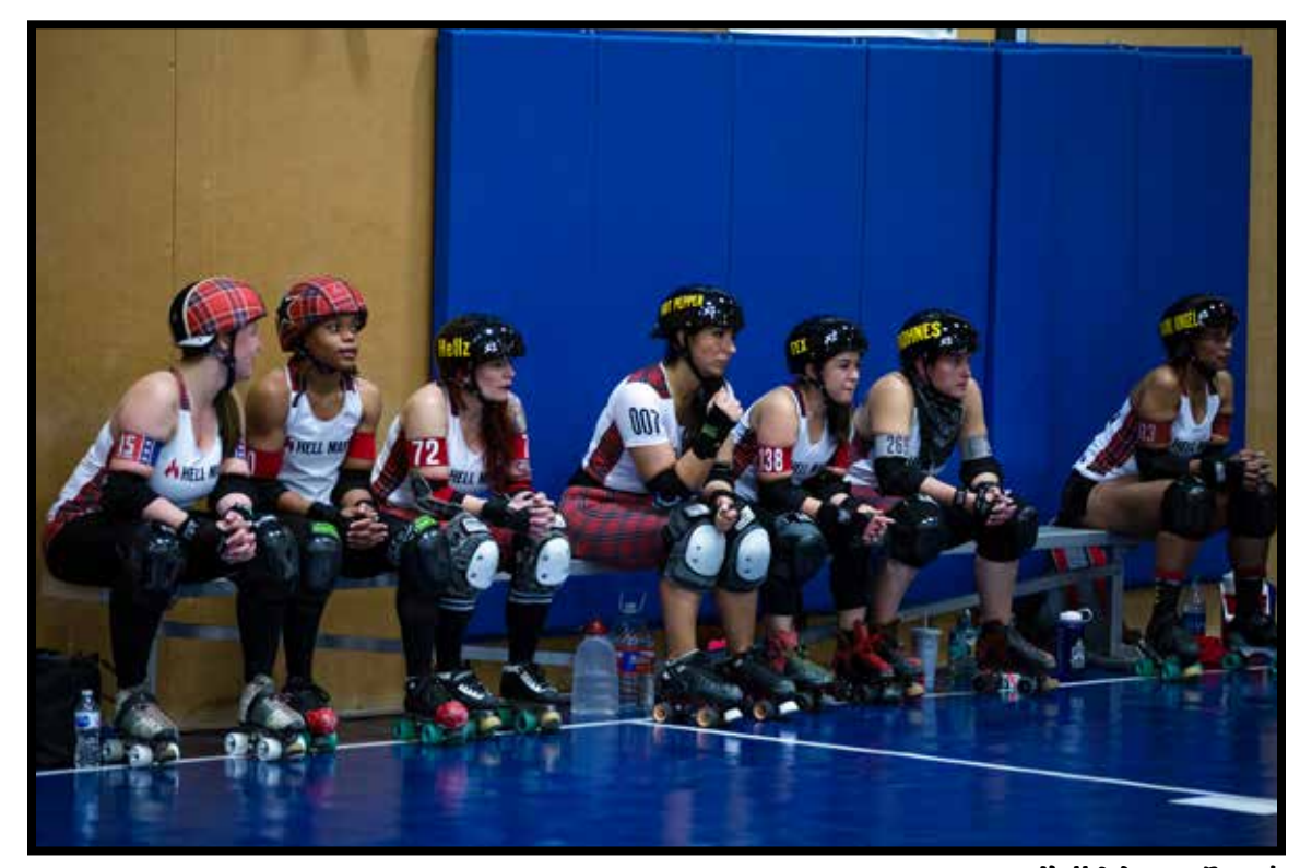
Hell Marys Bench