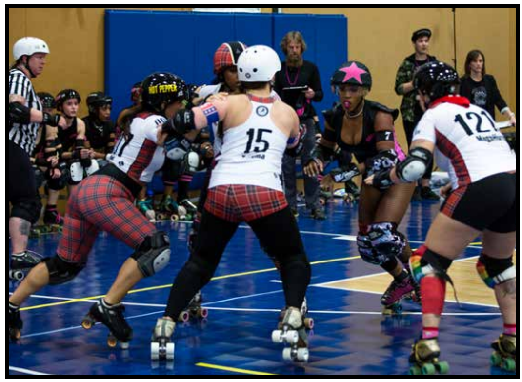
Princess looks for an opening