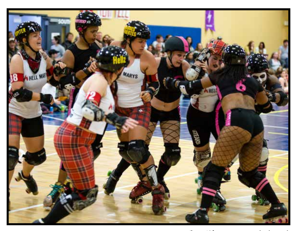
PeaceWar tries to push through