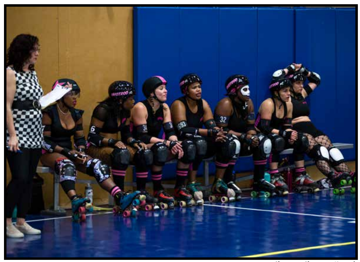
Hotrod Honeys Bench