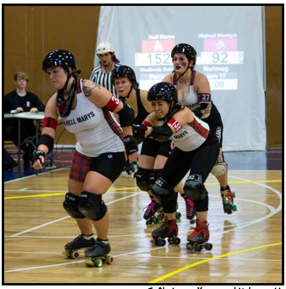
Tx Chainsaw Kassacre hitches a ride