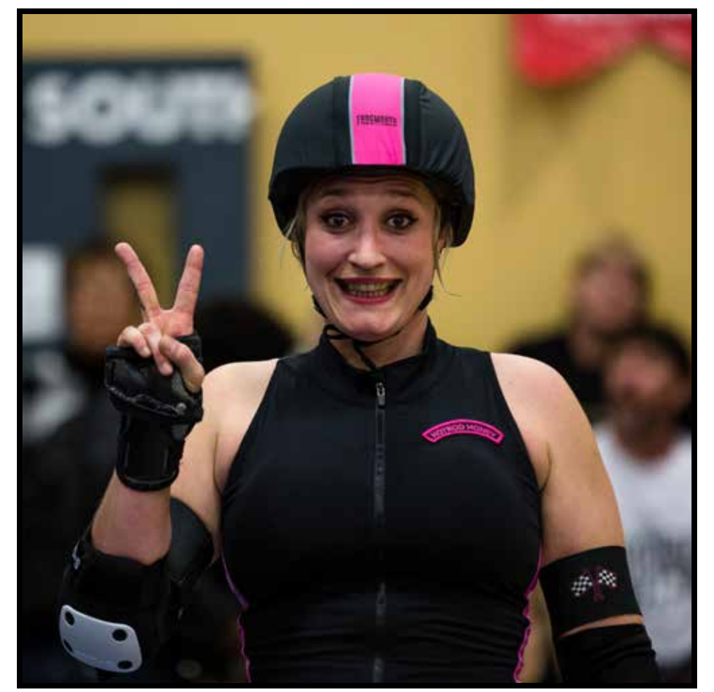
S-Pain flashes the peace sign