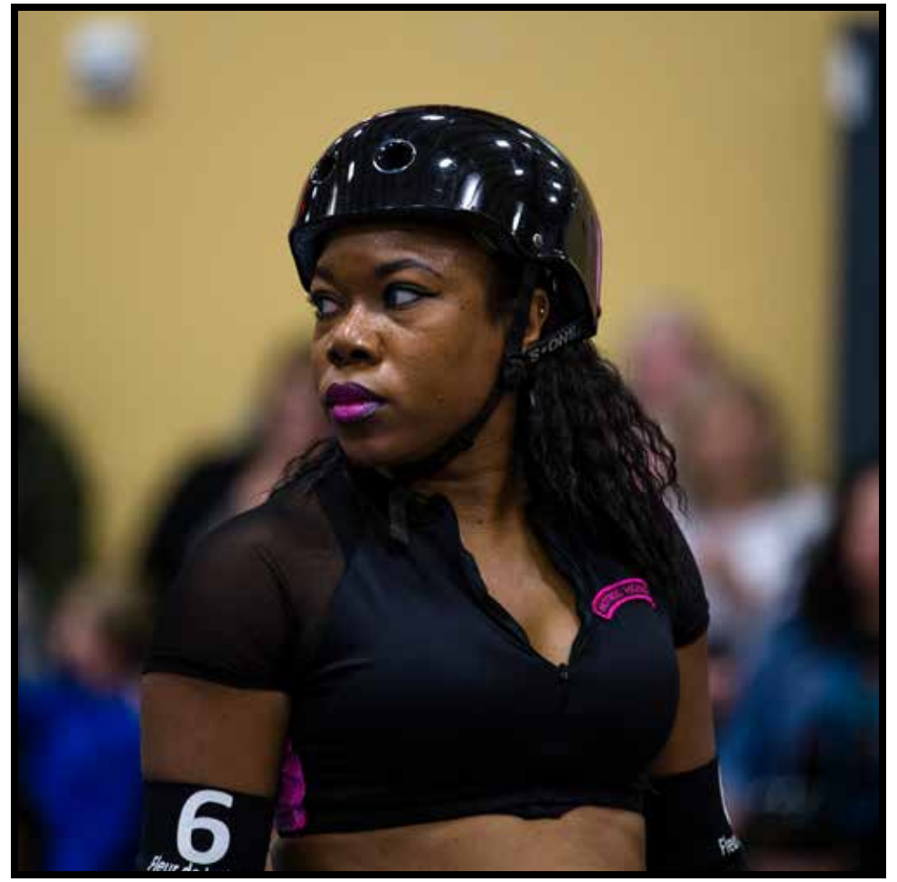
Fleur de Lethal