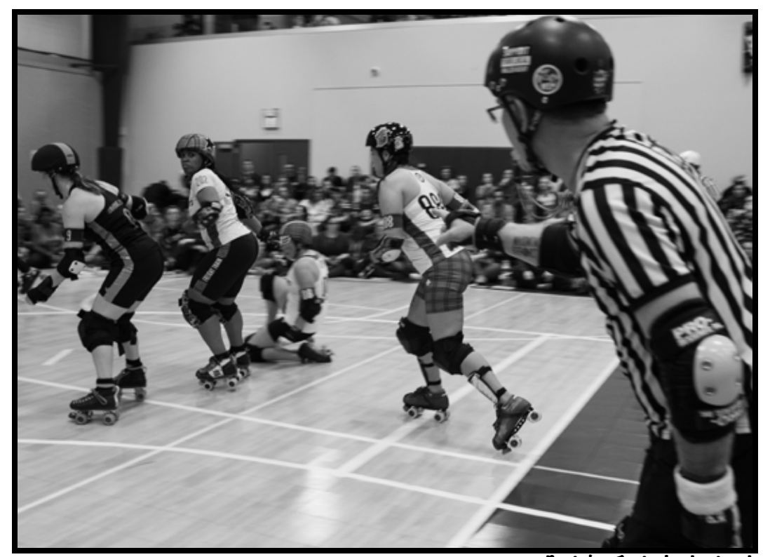
Freight Train looks back